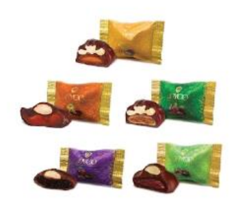
Fruit & Nut Chocolate Individually Wrapped 5 for $5